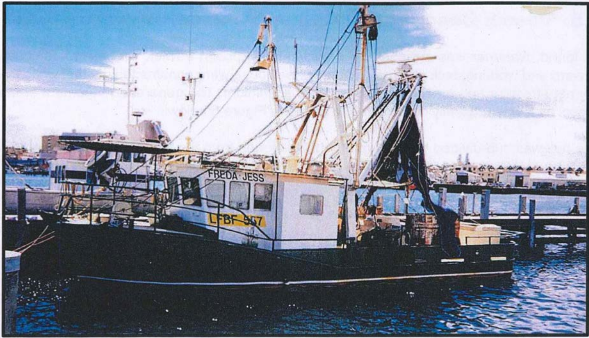
Photo 1 -Historical photograph of vessel