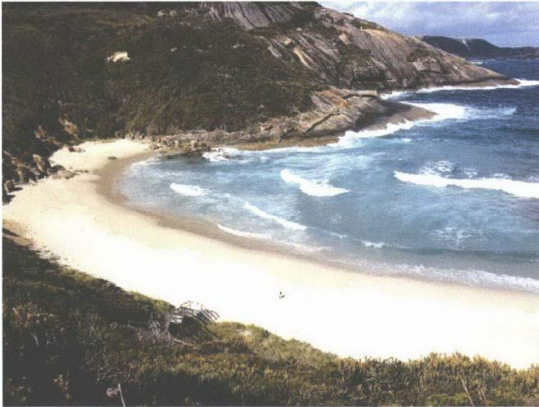
Exhibit 1, Volume 1, Tab 20, Page 3 – Salmon Holes Beach

It is generally recognised rock fishing is intrinsically dangerous due to the locations from which fishermen choose to fish. 6