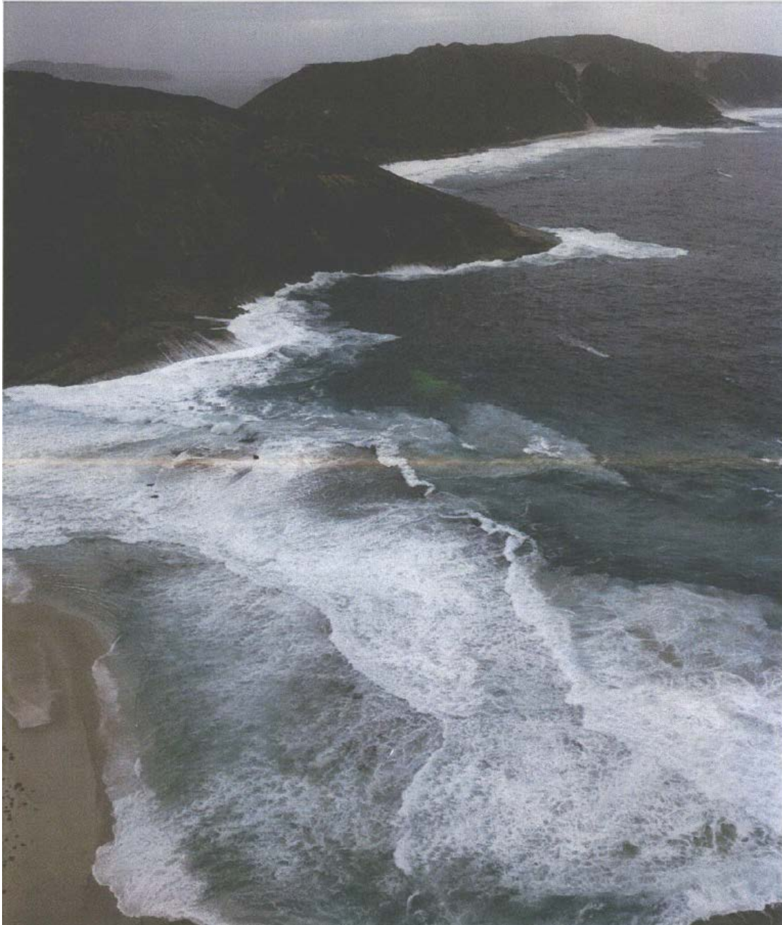
Exhibit 1, Tab 21, Page 10 – Photo taken by Lifesaver Rescue Helicopter on 18 April 2015 - Green sea dye deployed by helicopter to determine the flow of current/rip.

Using data supplied by the Lifesaver Rescue helicopter on 18 April 2015 of the surface water flow a search pattern for the on water search was established using local expertise to