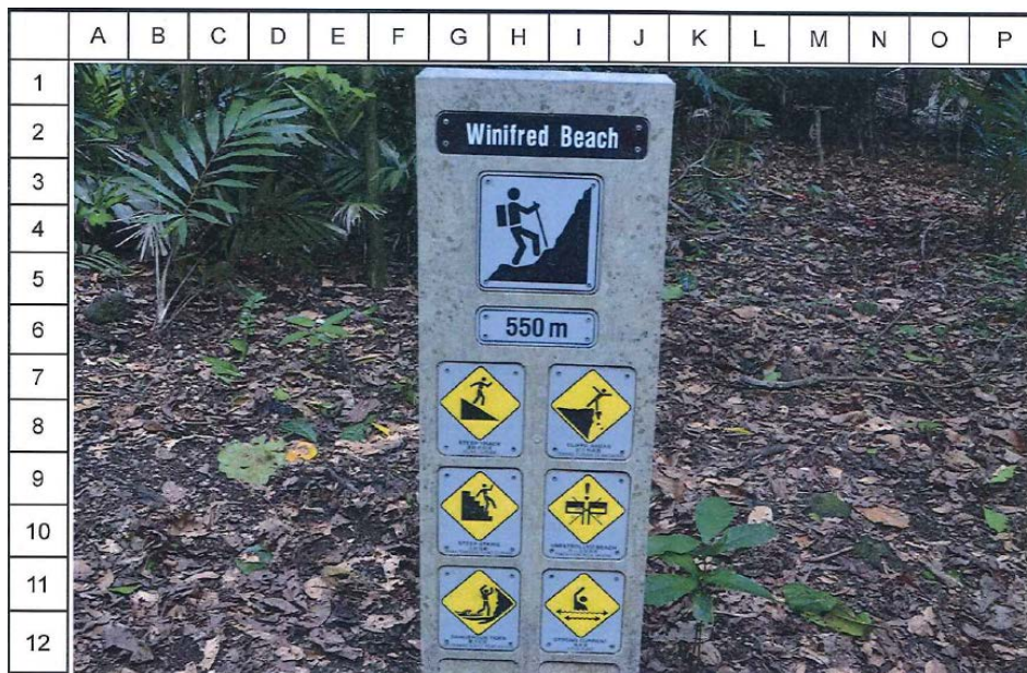
Exhibit 5, Page 6 – Sign at Winifred Beach carpark, at entrance to walking track

35. Signs are erected at the commencement of the marked walking trail to Winifred Beach, and again at the top of the steep aluminium staircase, warning people of the hazards ahead.