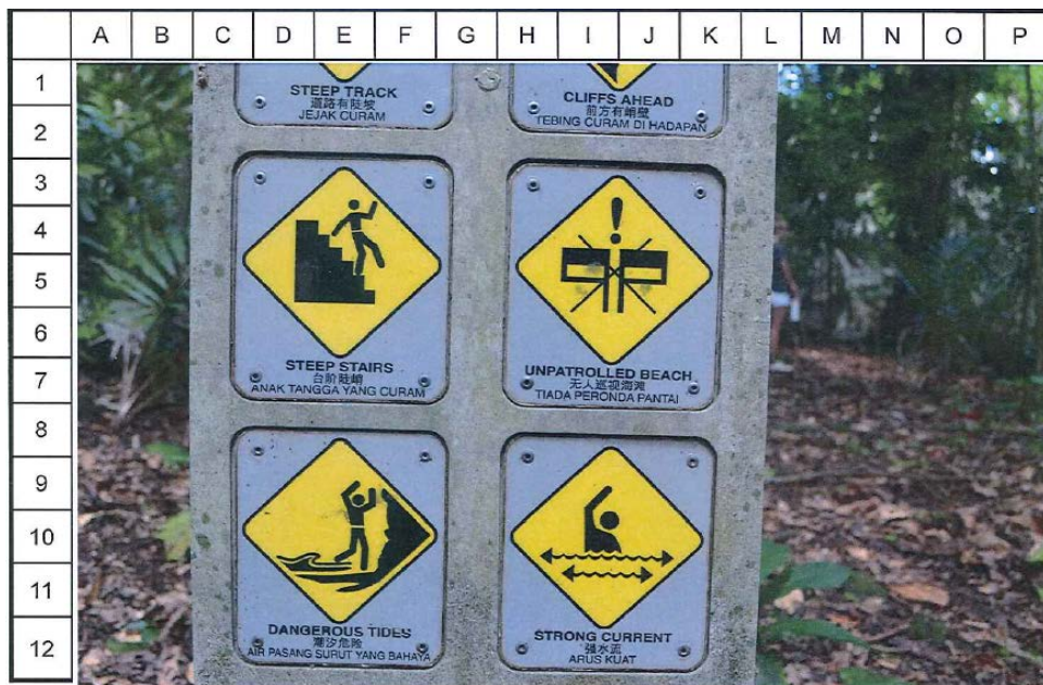
Exhibit 5, Page 7 – Close-up of sign at entrance to Winifred Beach walking track