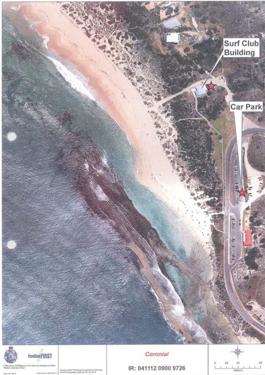
Aerial Photograph of Yanchep Lagoon, Exhibit 1, Tab 21