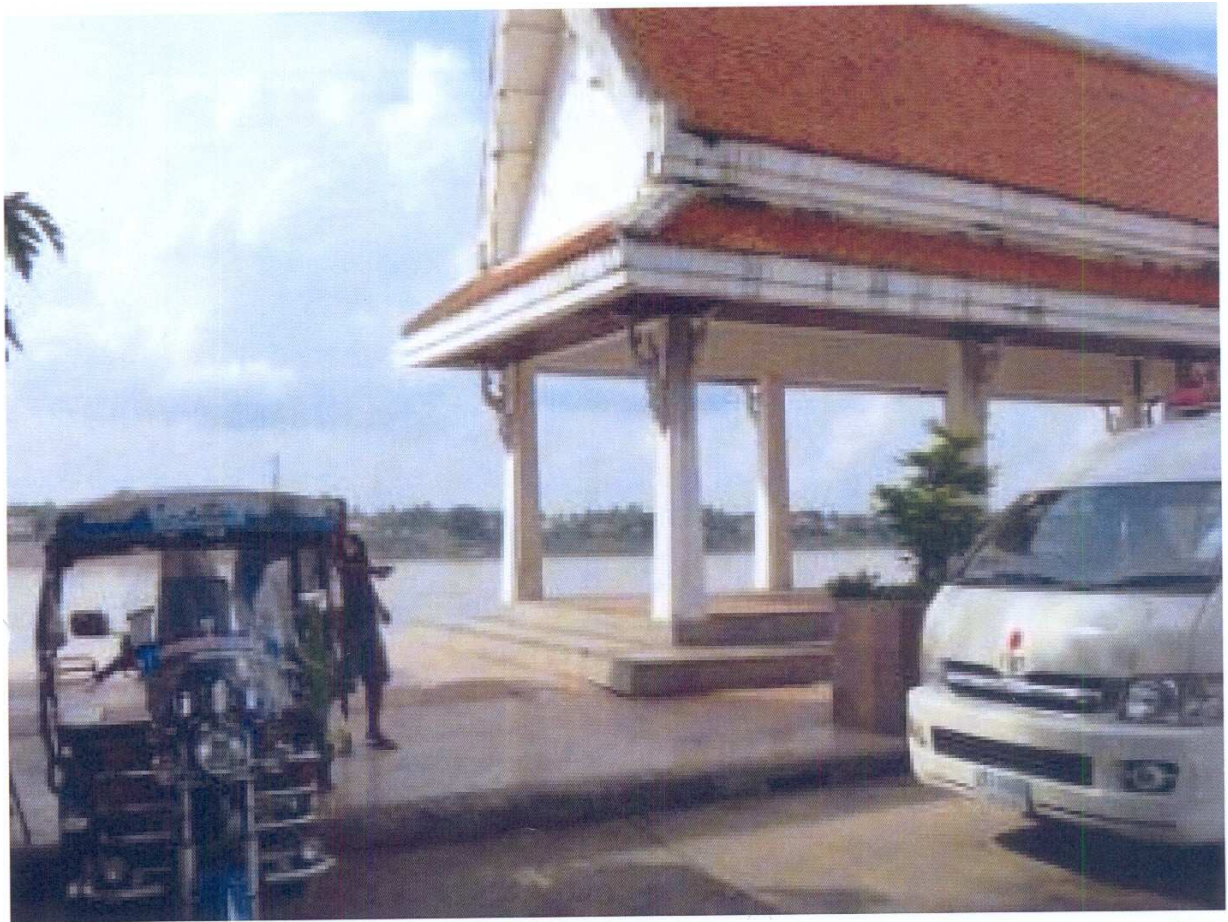
Photograph depicting the temple on the banks of the Mekong River

This is the last known sighting of the deceased.