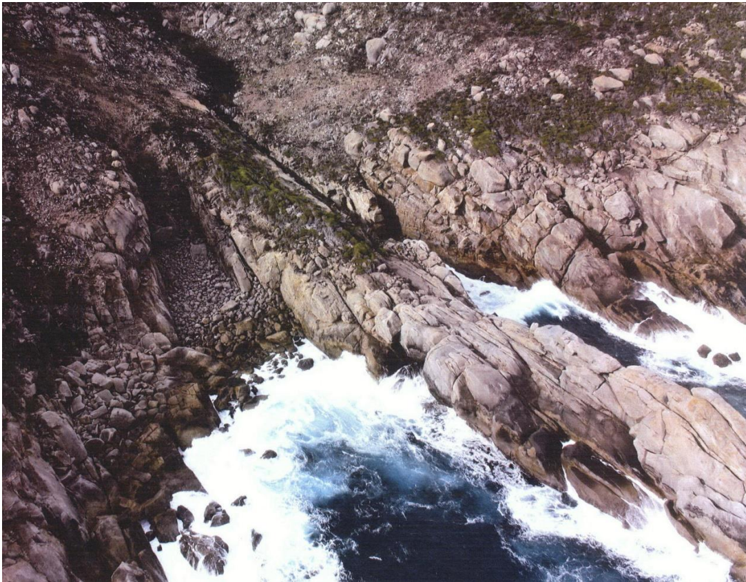
Photo 2: Aerial view of the rocks near where Damien went missing 36